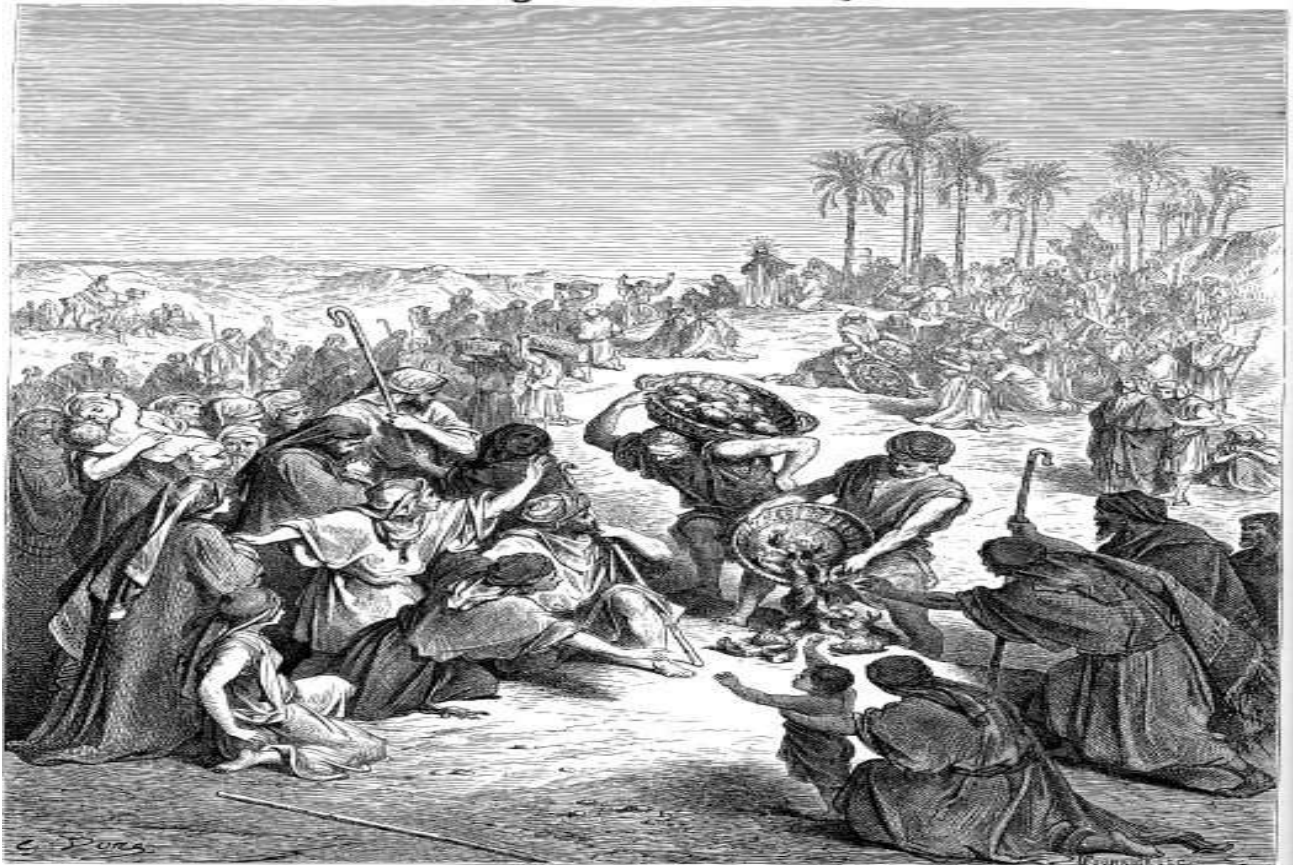
"Christ Feeding the Multitude" by Gustave Doré

Doré Bible Illustrations - Free to Copy www.creationism.org/images/