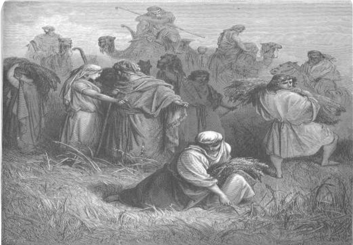
"Boaz and Ruth" by Gustave Doré