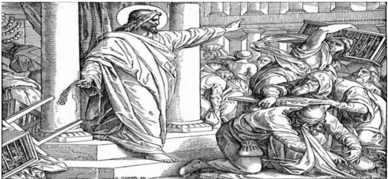
***JESUS CLEARS THE TEMPLE

12After this he went down to Capernaum with his mother and brothers and his disciples. There they stayed for a few days.